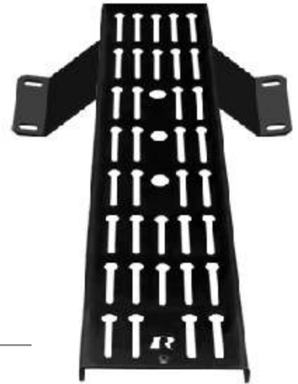
RAM-VC-LEG-101(Leg Kit) shown attached to RAM-VC-TP-29 (Top Plate)